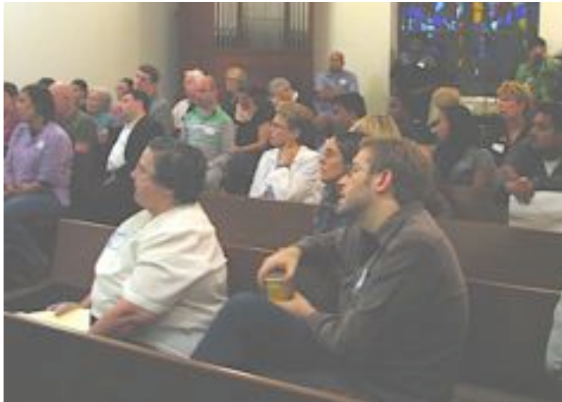
Over sixty members came together for our second annual working retreat.